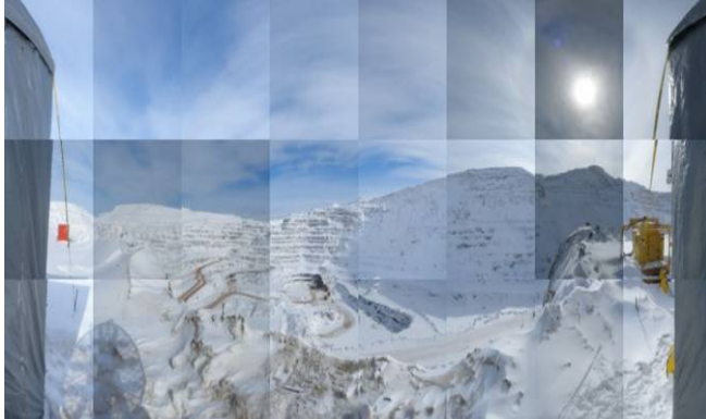
▲ Mont-Wright Mine in winter as viewed by the SSR-X