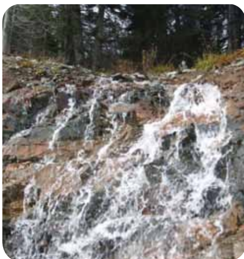
▲ Heavy rainfall created large volumes of water entering the diversion channels.

“Seasonal weather and wind events made for rapidly changing atmospheric conditions – proving SSR system and data algorithms to be adaptive while continuing to provide excellent returns.”