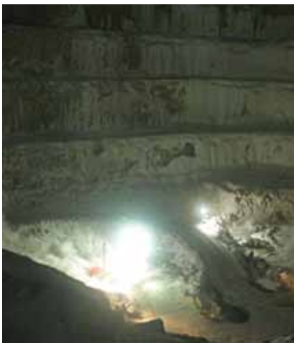
▼ RC Drillers in the kimberlite during the 2009 drilling program.