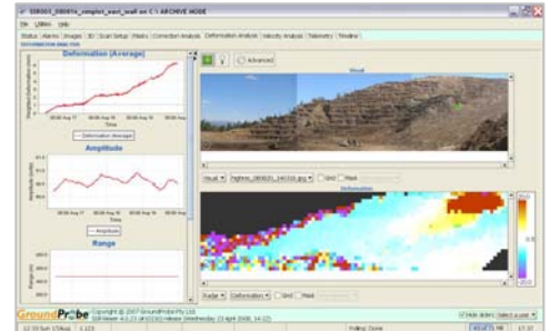
▲ Deformation figure for moving slope